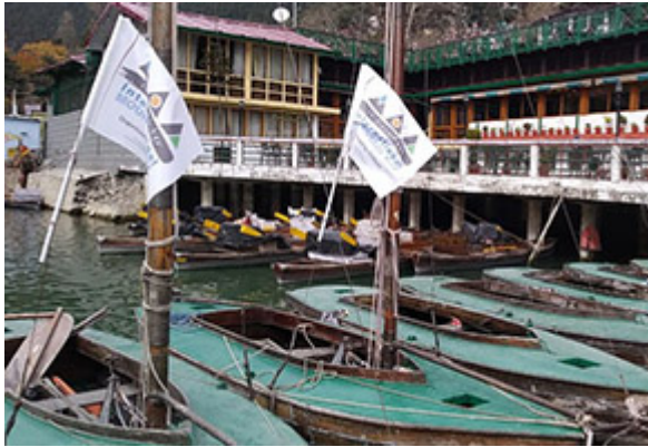
Asia and MENA